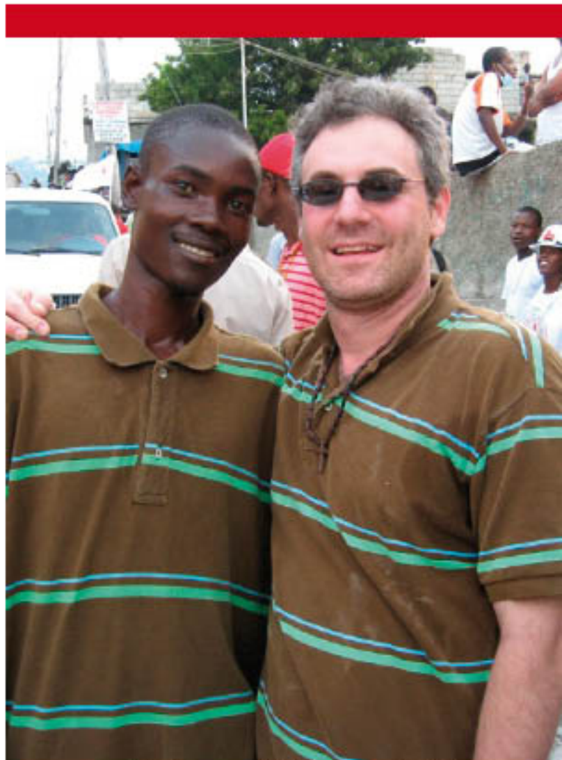
WhereisLarry.com in Haiti www.streetreportmagazine.net >>>> 31